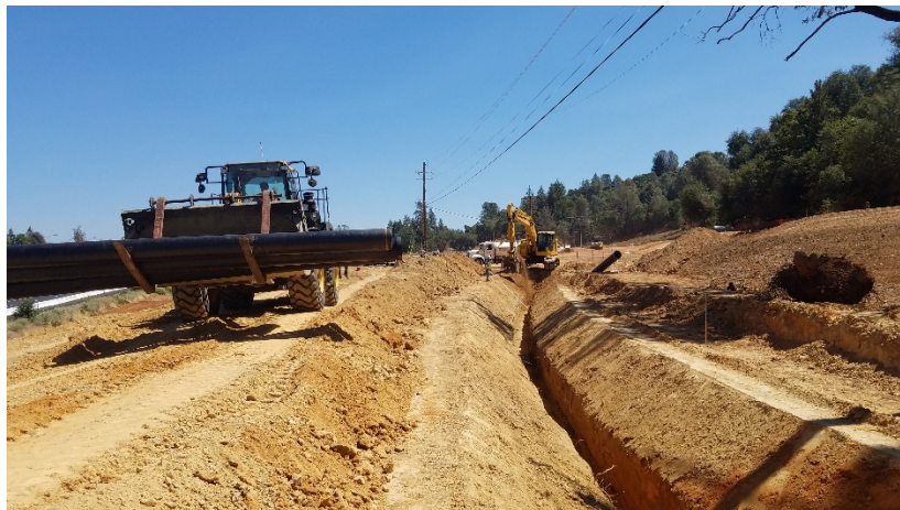
Pictured: Trenching for new 12" ductile iron water mainline